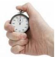
Quick Service Time

Items 5, 6, 7, 8 and 9 will establish the most appropriate size of filter. This is generally a compromise between those factors favoring a small filter (fast response time, smallest space requirement, lowest cost) and those factors favoring a large filter (long service intervals, low pressure drop).